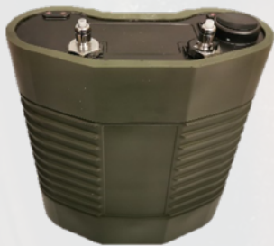
Controller Unit with Container